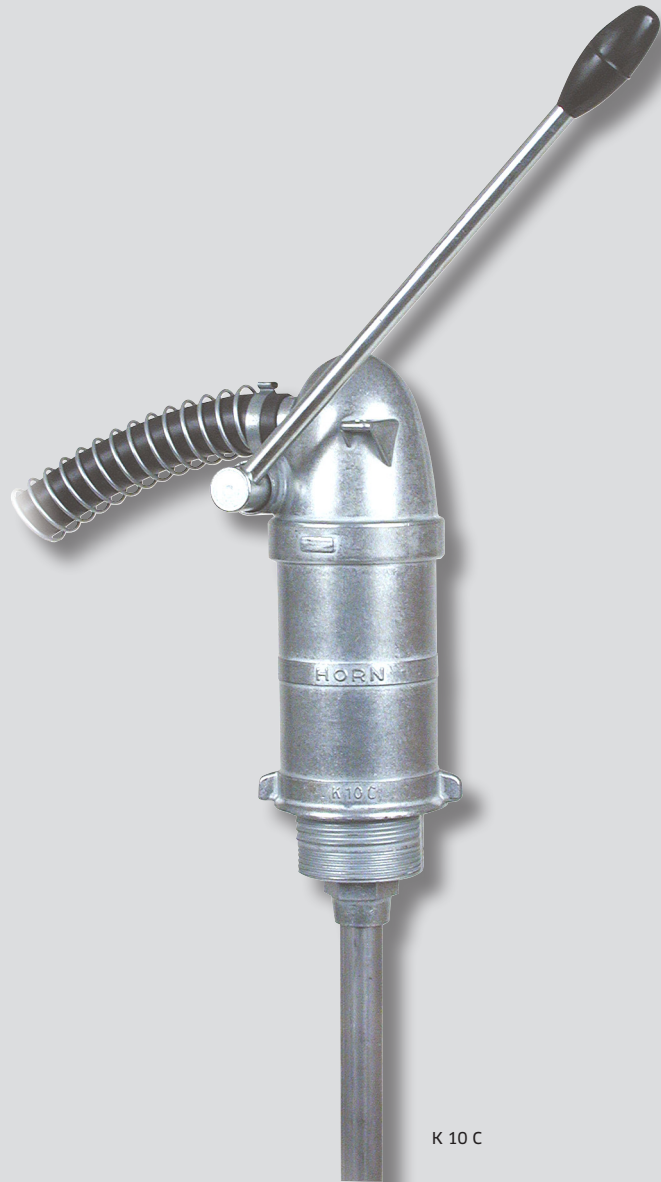
K 10 C